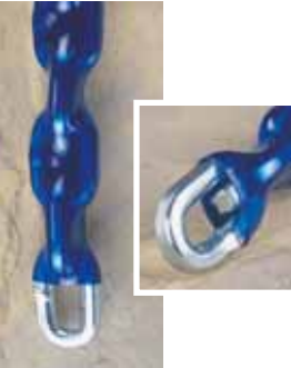
10mm & 14mm also available unsleeved in lengths up to 10metres

High grade, square section chain made from special alloy steels for maximum strength. Through- and case hardened for high resistance to hacksaws and boltcutters. Bright zinc plated with blue thermoshrunk sleeve. 14mm chain in plastic or fabric sleeve. High security rating.