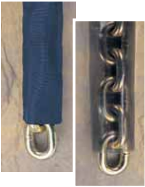
Also available unsleeved in lengths up to 10metres

Our heaviest duty chain made from highest grade alloy steels with a three stage through- and case hardening to give maximum possible resistance to saws and boltcutters. Plated in a distinctive gold colour and covered in a thick plastic sleeve or flexible fabric cover. Highest security rating.